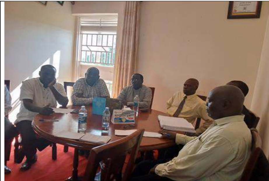
Consultants together with the Namayingo district technical officials in CAO's office