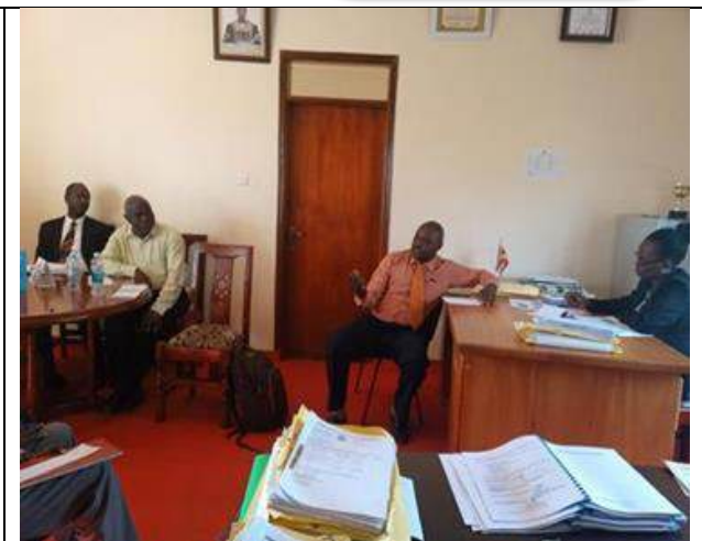
After workshop meeting with CAO and other district technical officials to know the roles of the district and consultants and set time lines for deliverables.